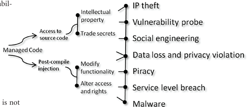
Figure 2: Risks stemming from unauthorized access to source code via reverse engineering and post-compile code injection.

With easy access to reverse engineering tools and code injection technology, unauthorized access and modification of managed code can pose a broad spectrum of risks (Figure 2).