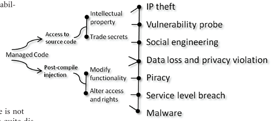
Figure 2: Risks stemming from unauthorized access to source code via reverse engineering and post-compile code injection.

With easy access to reverse engineering tools and code injection technology, unauthorized access and modification of managed code can pose a broad spectrum of risks (Figure 2).